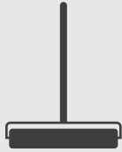
10-12mm Nap Roller *Do not use Microfibre

The following equipment is recommended for this application.