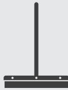
Serrated and Normal Squeegee