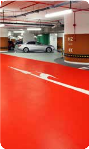
Basement Level Car Park Deck Systems