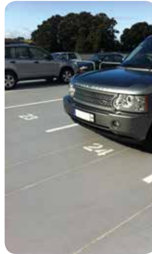
Roof Level Car Park Deck Systems