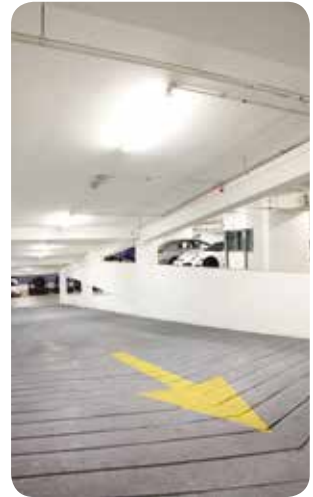
Heavy Duty Deck Systems for Ramps

This guide has been produced to give an overview of floor specification considerations when selecting suitable moisture-proofing and resin deck coating systems on lowest basement, intermediate and roof level decks of parking structures.